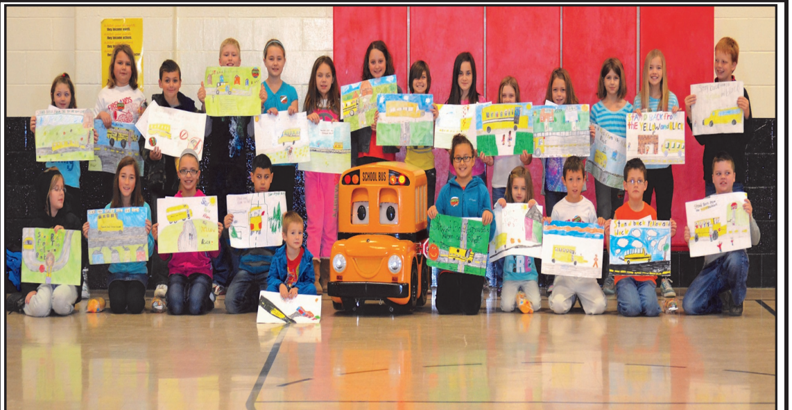
Pictured are the School Bus Safety Poster contest participants for School Bus safety week 2012.

The drivers have an awesome responsibility to get the students to and from school safely and your help is essential!