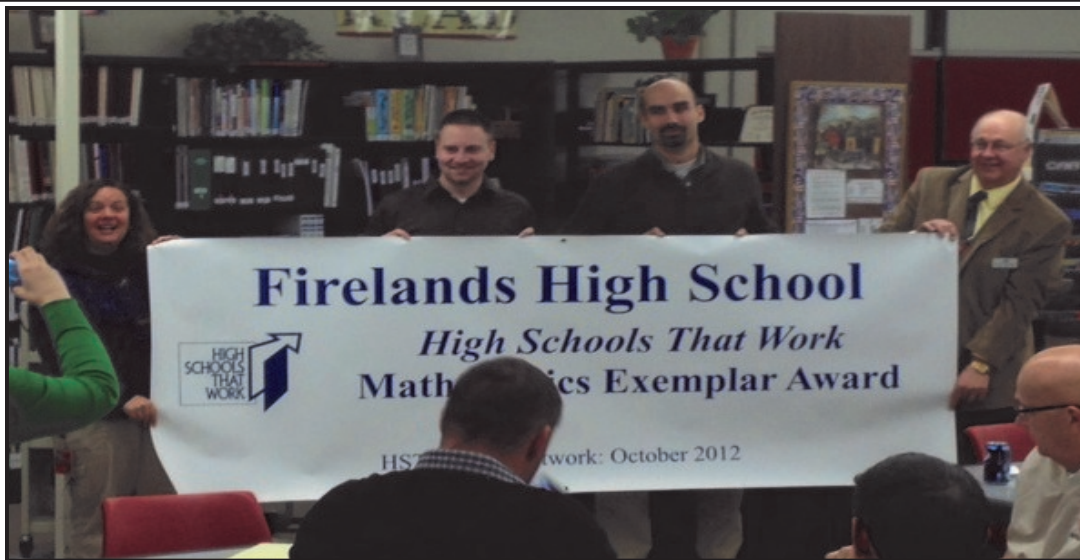
Firelands High School Math teachers and staff were presented with the High Schools that Work (HSTW) Mathematic Exemplar Award on Wednesday, November 14th, 2012 during morning professional connections.